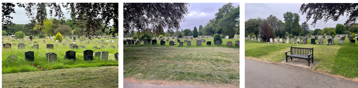
Grass swaths cut on main access paths and around features

weather early in the season but a robust catch up program is currently in place to catch up with extra resources deployed by IdverdeUK.