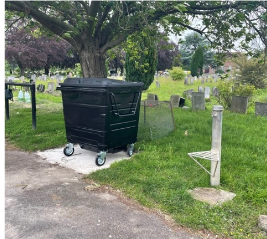
Black Euro-bins at MSJC